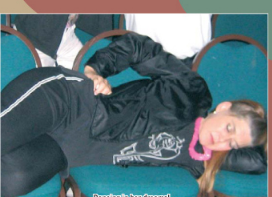
Dancing in her dreams!

48 Thanks so much to Linedancer Magazine and website ( www.linedancermagazine.com ) for sharing this lovely article about a special friend.